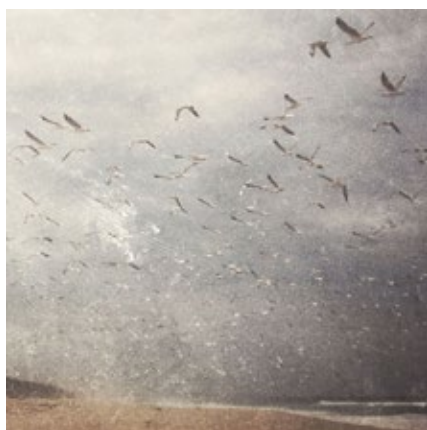
BIRDS, C-Type Archival Photographic Print

It's also worth mentioning how important it is to keep strengthening the positive cultural identity, through our art seen in major Australian festivals and on TV, in Poland and abroad. To know that we Poles, despite our 'beatings' by our history, have good reasons to celebrate our 'Polishness', share it so that others can get a better understanding of our identity. No one wants to be remembered or referred to as a moaner, hole-digger and overly guilty and shameful victim of religion.